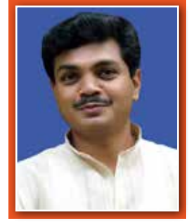
Our Inspiration Shri. Ranajagjitsinhaji P. Patil

INSTITUTE CODE : 2130 “FC” Facility Available